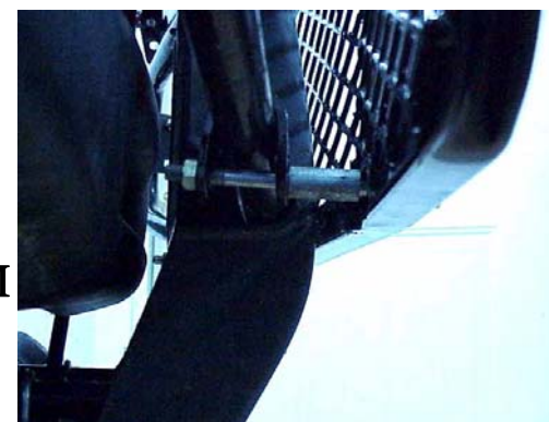
PICTURE ILLUSTRATES HOW TO MOUNT THE BOTTOM OF THE FG116 TO THE ORIGINAL BUMPER..