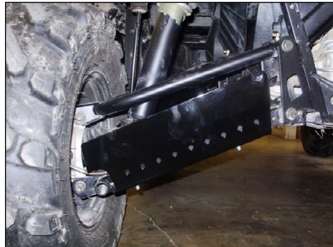
THIS IS PICTURE OF THE REAR LEFT GUARD ONCE MOUNTED...

MAKE SURE THE BRAKE LINE IS ON THE INSIDE OF THE GUARD AND NOT TOUCHING THE GUARD ONCE MOUNTED.