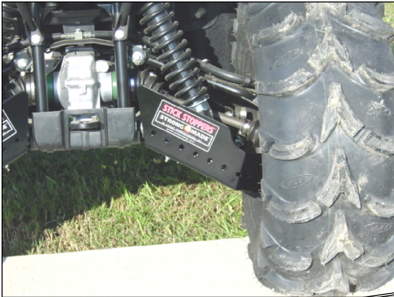
THIS IS A PIC OF A DIFFERENT MACHINE BUT IT WILL BOLT THE SAME ON THE KODIAK 700.

EVEN THOUGH THE NEW BOOT GUARDS YOU HAVE PURCHASED WILL COVER MORE THAN THE ORIGINAL PLASTIC GUARDS. BOOTS HAVE BEEN REPORTED TO BE TORN IN SOME CONDITIONS. SAVANT MFG. (STRONG MADE) DOES NOT WARRANTY ANY TORN BOOTS.